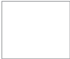
Pad Print - Front 100%